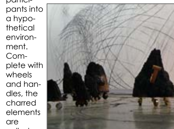
Fire Successional, by Tiki Mulvihill

Inspired by a landscape recently ravaged by fire, Tiki Mulvihill's installation, Fire Successional allows spectators to enter as active participants into a hypothetical environment.