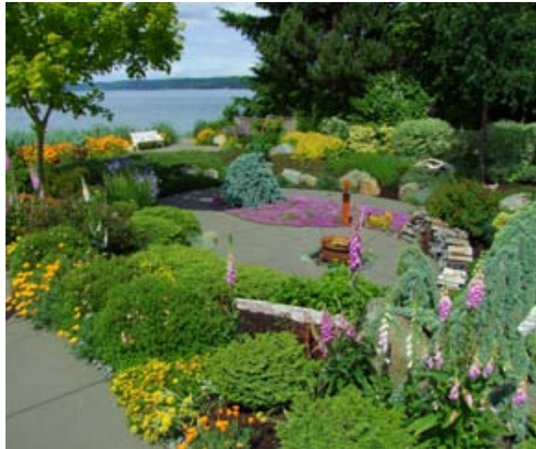
Jack Oja's stunning garden was a huge hit during the 2011 Garden and Art Tour.

Complete with wheels and handles, the charred elements are pulled around by viewers, leaving their charcoaled tracks on the Gallery floor. This exhibition draws attention to the fragility and resilience of Western forests.